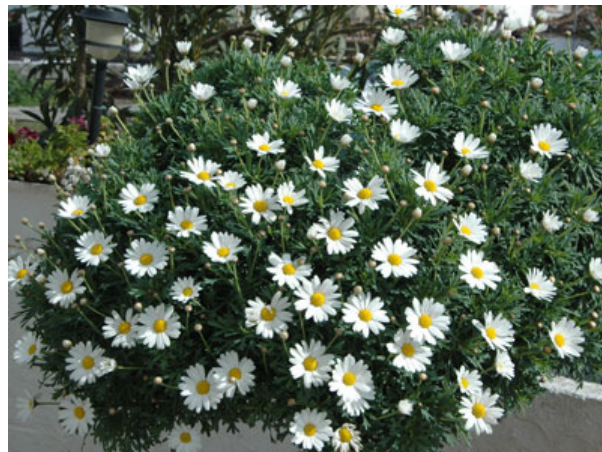
Flowers in Kokkari