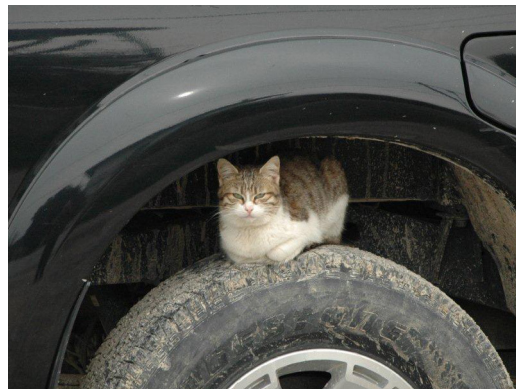
As usual: Cats everywhere!