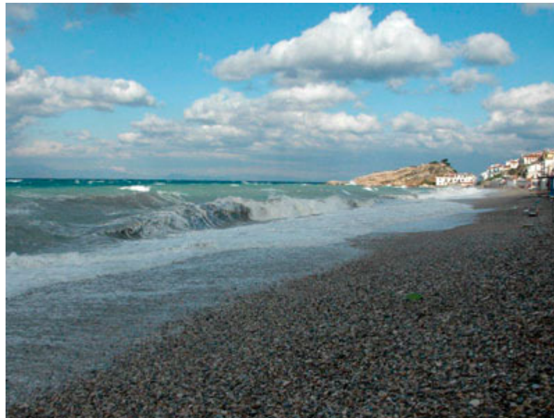
The beach by Alfa Bar. This day it was absolutely not inviting to a swim. 2 days later the sea was like a mirror! The water temperature is for the moment around 17° C.