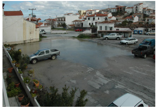
The parking place still needs drain!