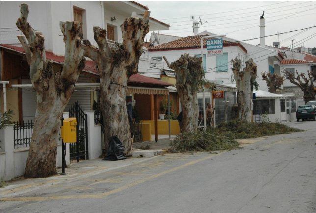
The trees are having their “Spring-cut”