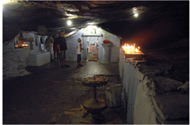
In the cave by Spilliani monasteri

We also visited the dairy in Mitilini (full reportage will be brought on samostour).