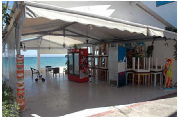
Closed and/or empty everywhere

The big travel companies, such as TUI and Thomas Cook, now control more or less all the tourist traffic and when they stop with their charter flights it mostly indicate the end of season and that will also stop the rest of the tourist traffic. A few years ago, the season was from four to six weeks longer in total. There was an earlier start and later finish. But we have to mention that a few German and Dutch companies continue almost throughout October.