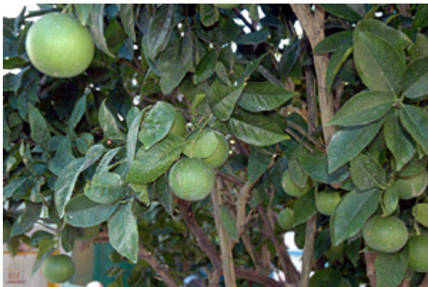
These oranges will be ready around Christmas.

Bathing temperature is also good, the last days the sea water temperature was approx. 22-23 degrees. For us Scandinavians, it is a very good water temperature.