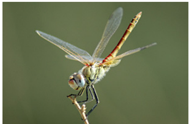
Beautiful 'smiling' dragon fly.

I also had to take a closer look at the "costal defence" at Tsarli (between Kambos and Agh. Konstandinos).