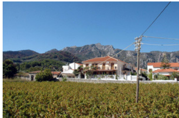
Wine yard down in Kokkari.