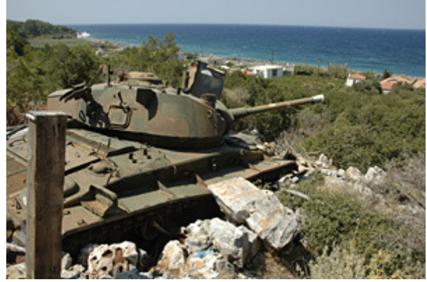
Partly buried old tanks.