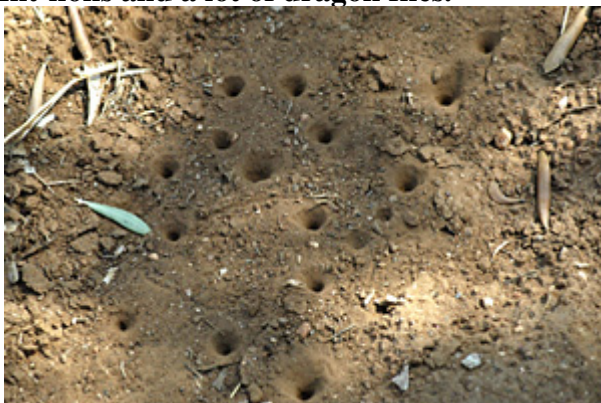
Ant-lion trap holes - about 50 on 2 square meters.

Many insects were active in the heat (except the mosquitos!). Among other things I found a colony of Ant-lions and a lot of dragon flies.