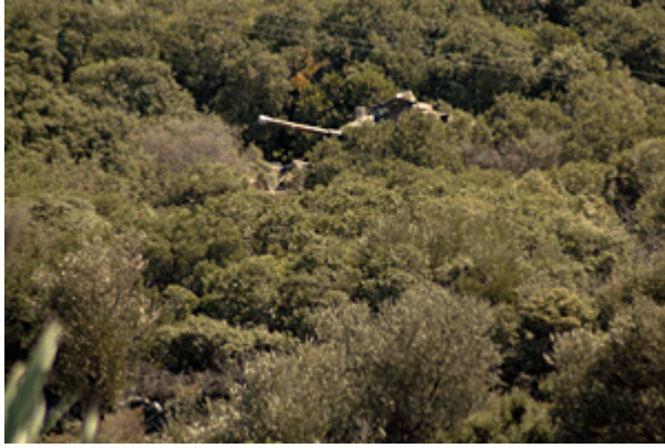
Seen from the coast road.